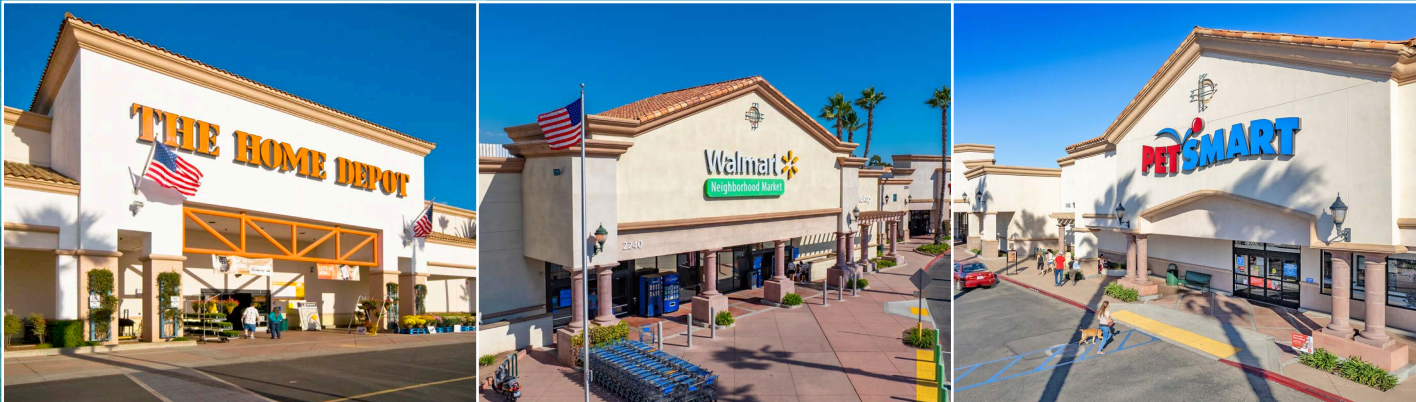
US HIGHWAY 101