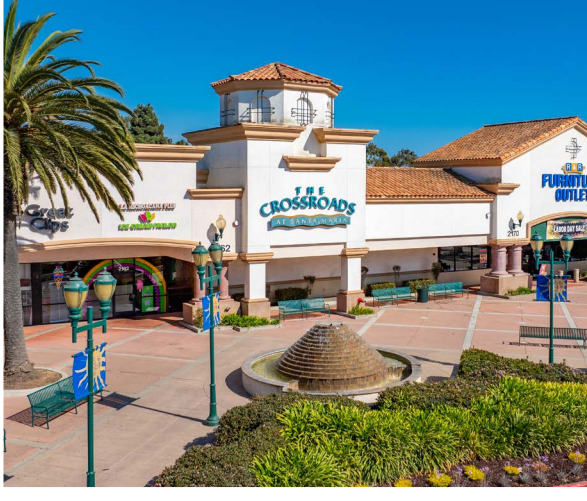
WELCOME TO SANTA MARIA