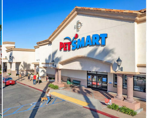
US HIGHWAY 101