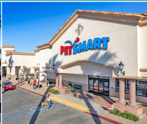
US HIGHWAY 101