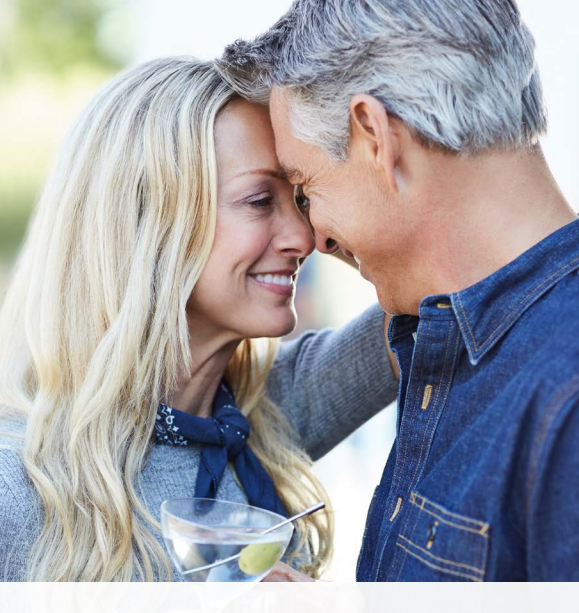
"WHERE THE RANCH SHOPS"