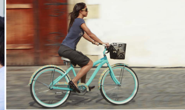
GOLETA'S FINEST VILLAGE LIVING