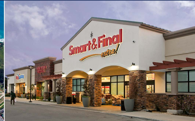
Adjacent to the Hollister Village Apartment Community