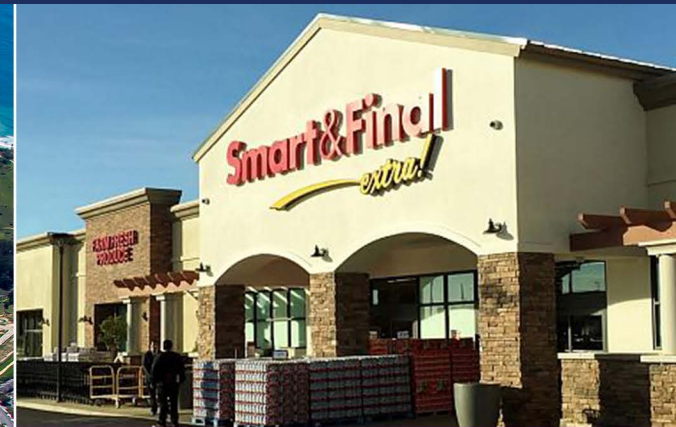
Adjacent to the Hollister Village Apartment Community